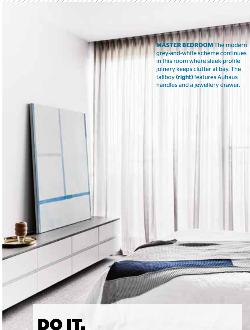
MASTER BEDROOM The modern grey-and-white scheme continues in this room where sleek-profile joinery keeps clutter at bay. The tallboy (right) features Auhaus handles and a jewellery drawer.